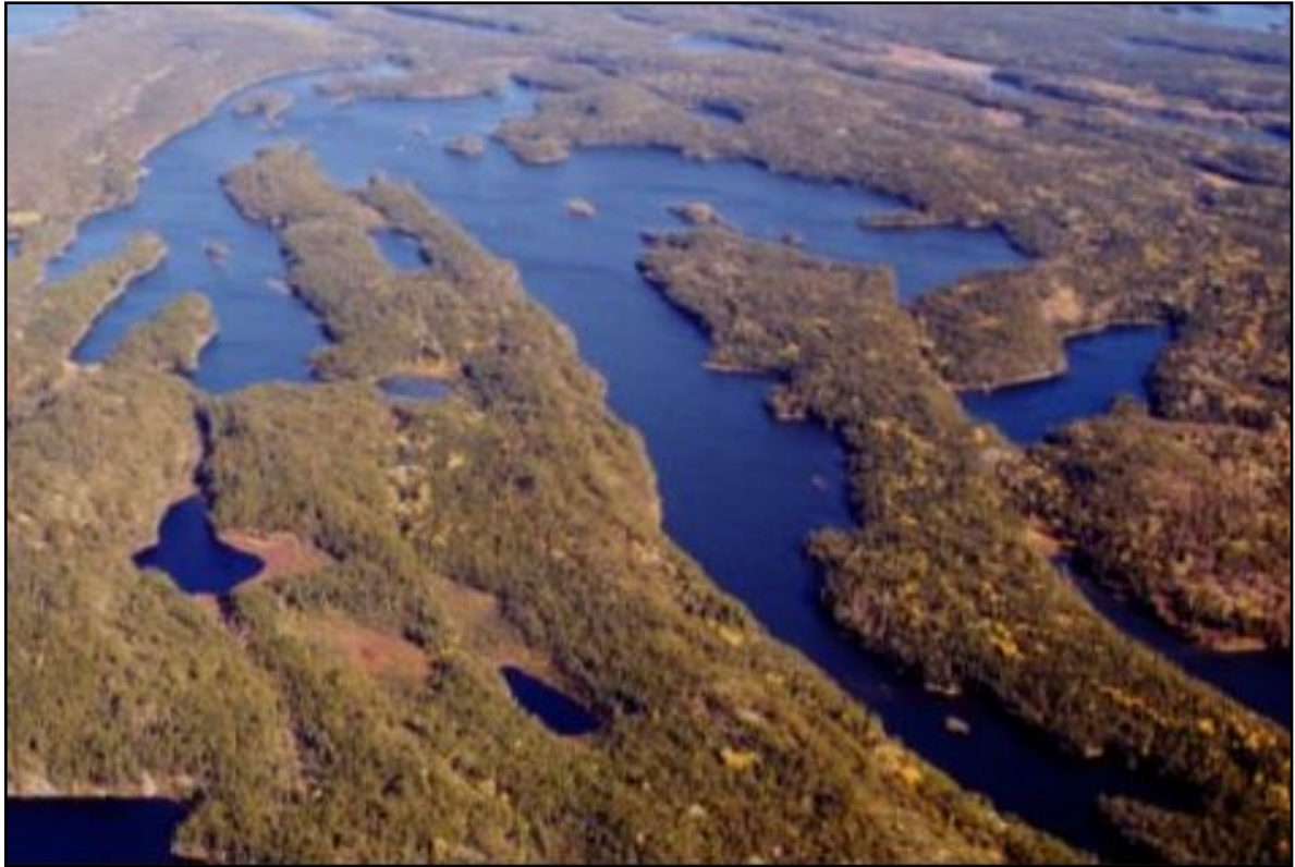
Photo of Preston Lake