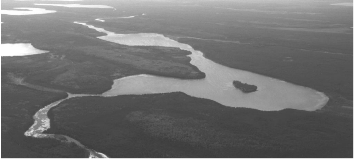
Photo of Derbyshire Lake